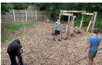
Maintenance work at the activity centre.